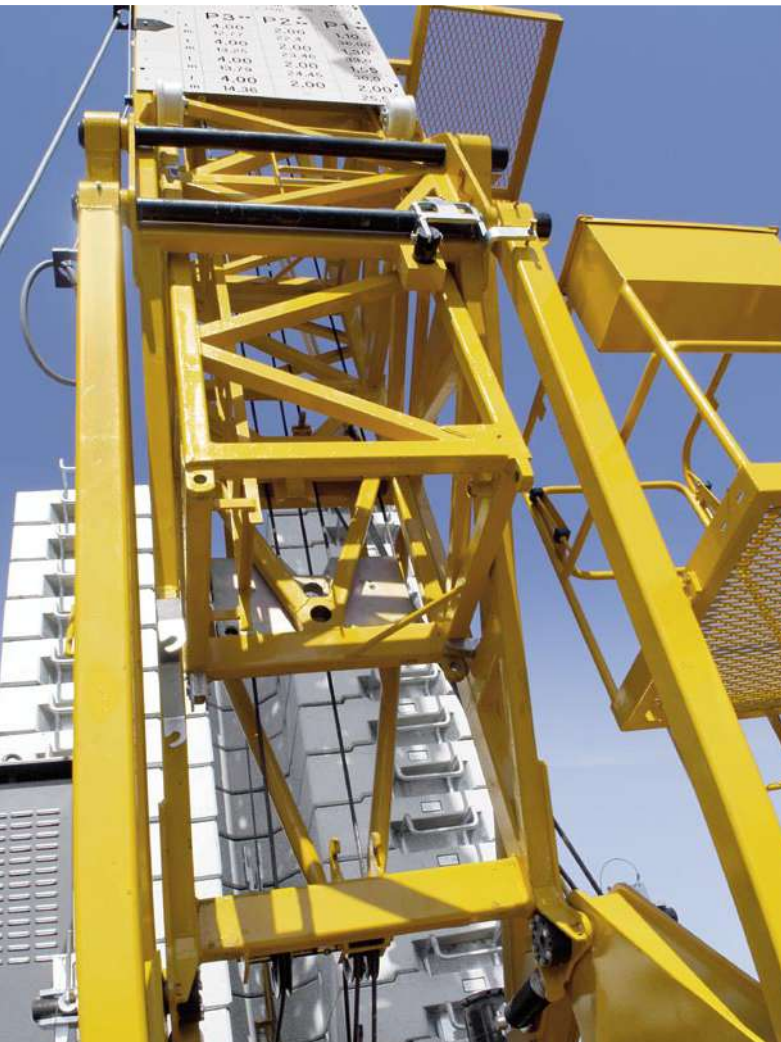
Further tower sections are inserted for greater hook heights.

To minimise costs in the crane park, tower sections from 35 K and 40 K models can also be used with the new 42 K.1 fast-erecting crane: an additional building block in Liebherr's modular system.