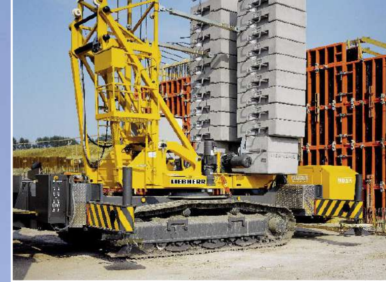
The 42 KR.1's compact crawler travel gear.

For use on difficult terrain, this crane is also available with crawler travel gear. Rapid relocation from one site to another with full ballast causes no problems.