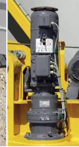
The EDC slewing gear.