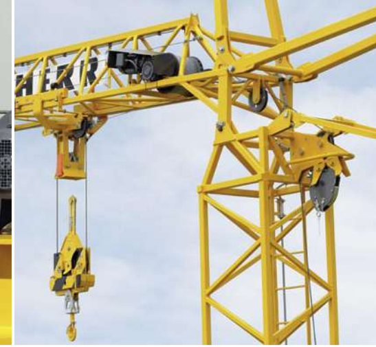
The trolley travel gear.