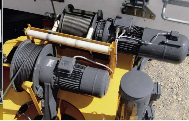
The hoisting and erecting winches.