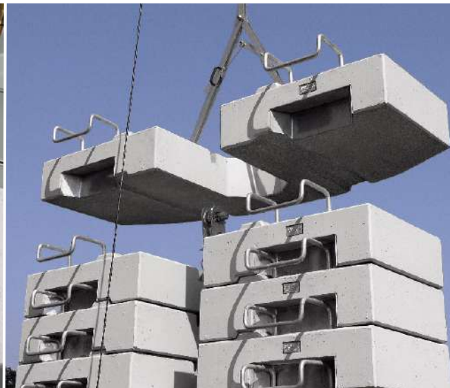
Automatic ballast slab centring.