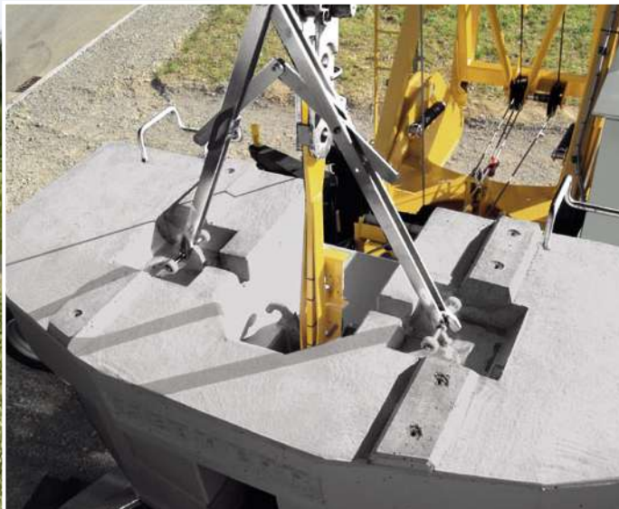
The semi-automatic ballasting device.

Ballast slabs from many Liebherr fast-erecting cranes can also be used with this crane – a further benefit that helps to reduce crane fleet costs.