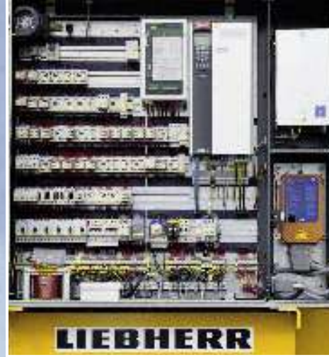
The switchgear cabinet.