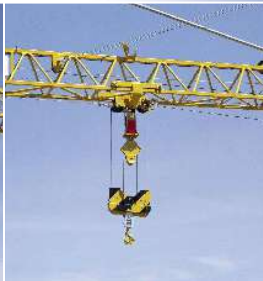
The new operating support.