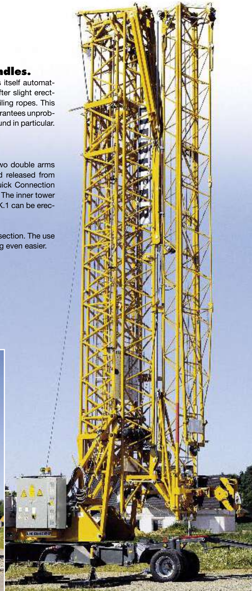
Unproblematic placing on support spindles, even on uneven ground.