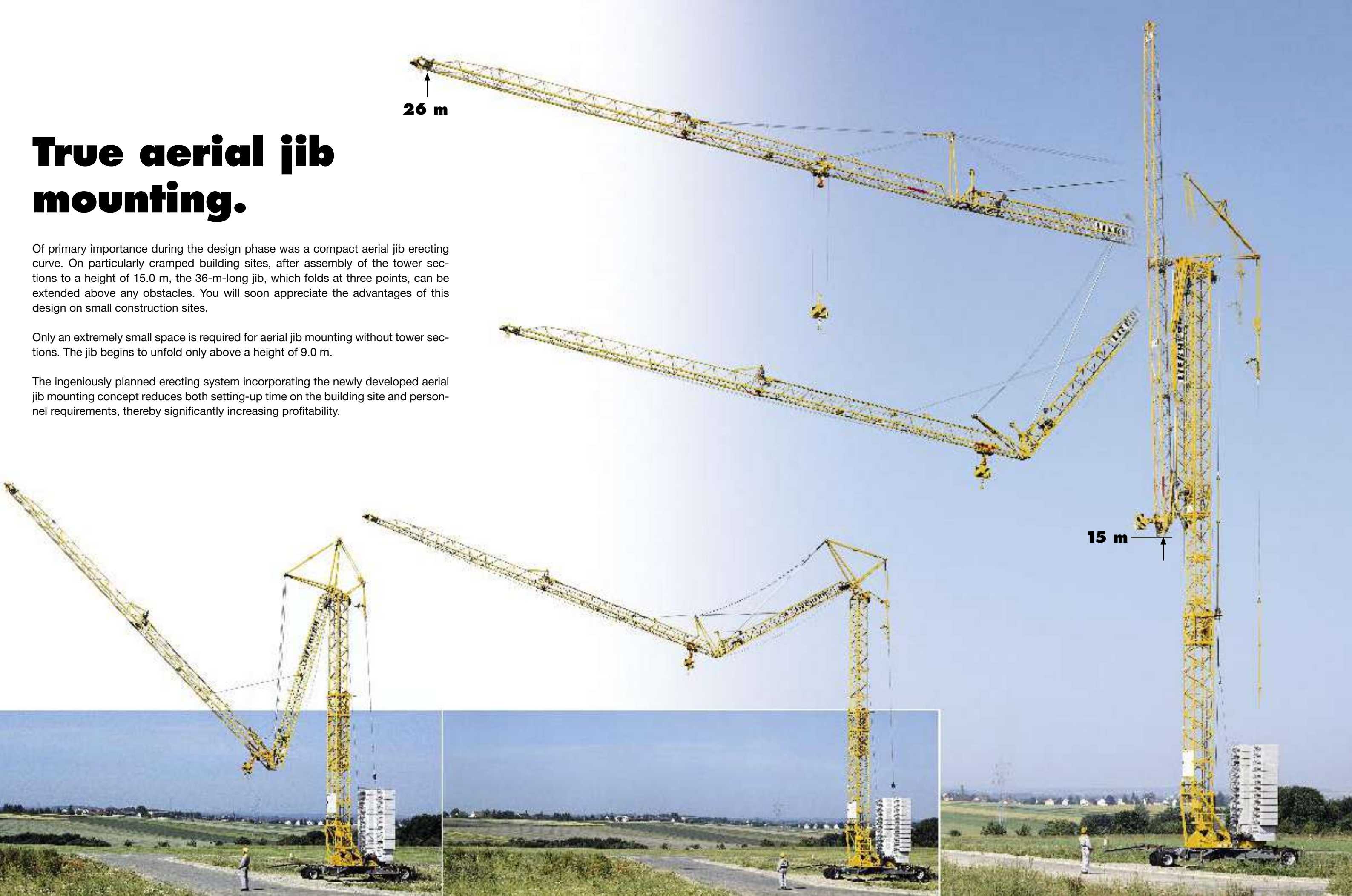
Aerial jib mounting without tower sections.

The ingeniously planned erecting system incorporating the newly developed aerial jib mounting concept reduces both setting-up time on the building site and personnel requirements, thereby significantly increasing profitability.