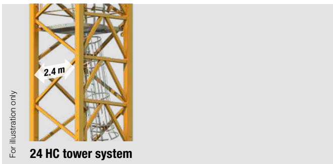
24 HC tower system

Re-reeving trolley available as an option